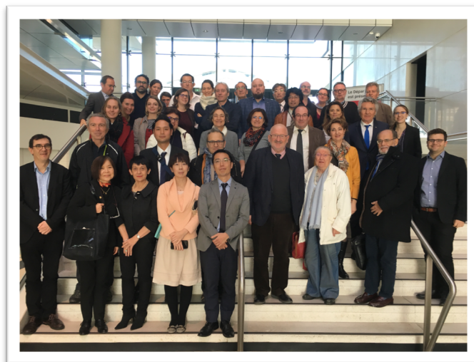
Participants of the stakeholder panel

On the day before, on 11 th of December, a seminar had enabled actors in the Bordeaux region to talk to their counterparts from Japan and Belarus involved in the long-term rehabilitation after the Fukushima-Daiichi and Chernobyl accidents. The reports mainly related to the difficulties and challenges for agriculture in how it deals with the long-term consequences of the post-accident situation. They presented their experiences of the remedial measures taken in the sector and the conditions and difficulties with regard to the resumption of agricultural activities after an accident.