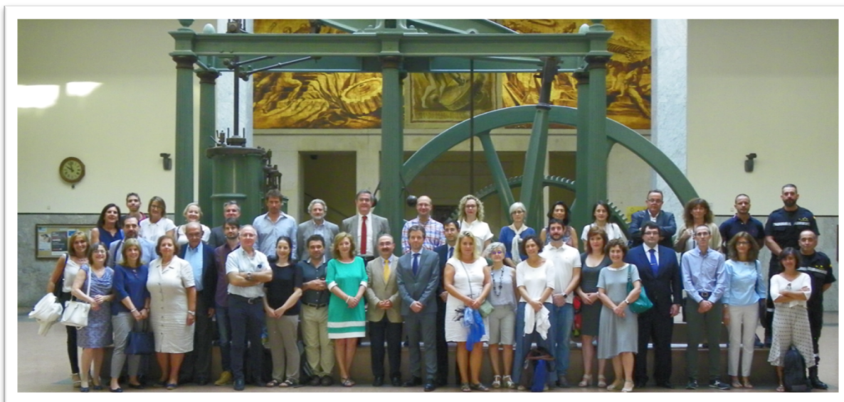
Participants of the Seminar on "Preparedness to Nuclear and Radiological emergencies: Keys to improve it" (SEPR)

The Workshop was a success and received a positive feedback from all participants who worked in groups to extract useful conclusions. Results are in preparation and will be soon published in the SEPR journal (in Spanish) and later in the European community (in English).