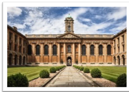
Queen's College, Oxford, UK

The agenda is available TERRITORIES website . Please note that registrations are closed.