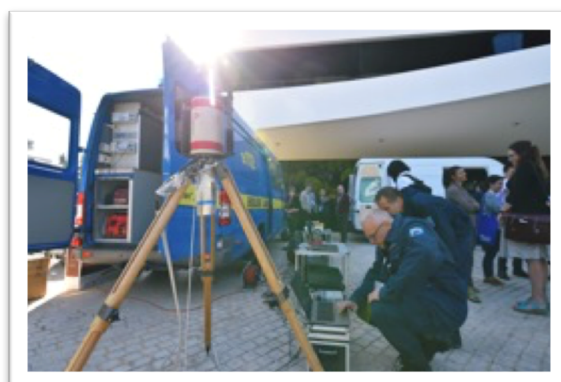
Croatian emergency mobile units