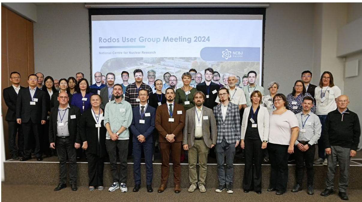
Participants of the RODOS User Group meeting, Otwock-Świerk, Poland

Key topics included the consequence assessment of nuclear-powered vessel accidents in the Arctic, the implementation of JRODOS in Belgium and Iran, optimization of warning station locations, and long-distance simulation of radionuclide transport using JRodos-Match. Additionally, a training course was proposed for participants. The full agenda of the event is available on the NBCJ website .