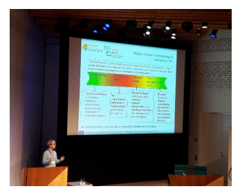
Robbe Geysmans (SCK•CEN)